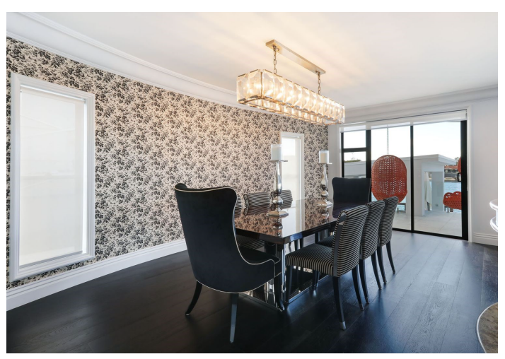
Exclusive Australian residence price ranging $8-10 million built with custom made Japan black flooring in French Oak