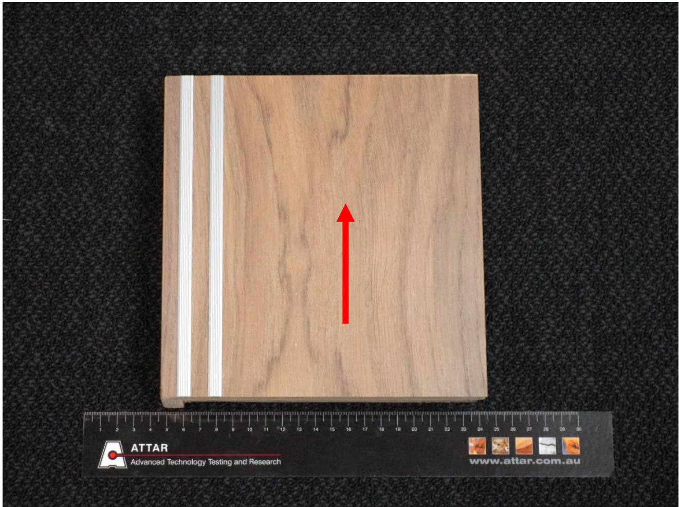
Figure 1: Sahara Oak. Arrow indicates direction of test.